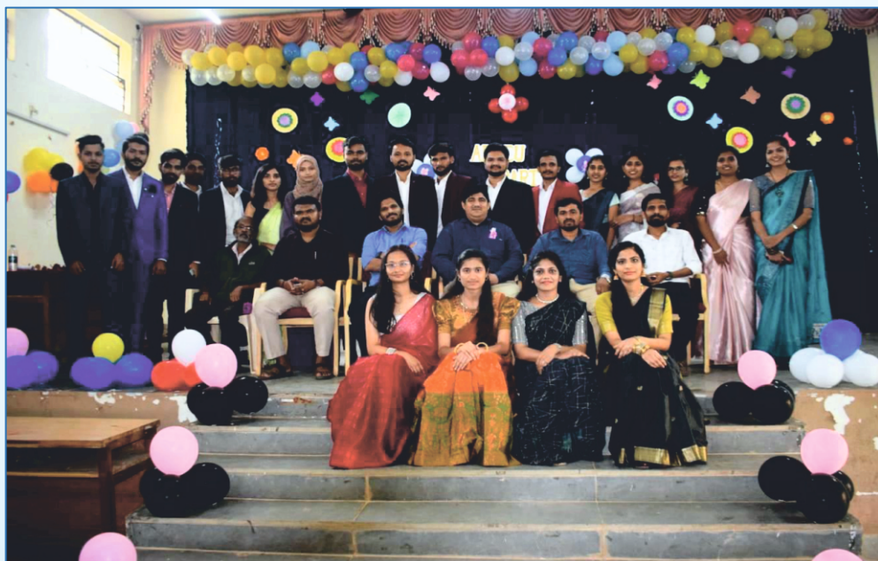
BATCH OF 2023-2024